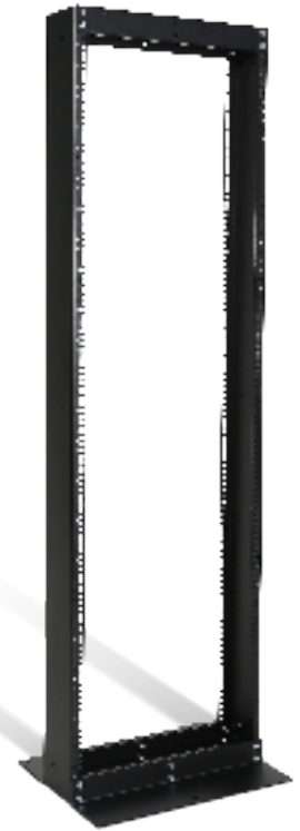
Steel, 2-post, square hole