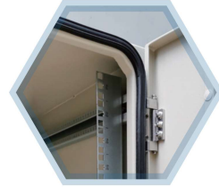
OUTDOOR CABINET Details of the figure