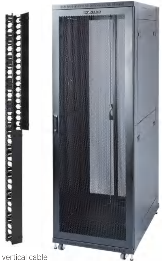
Front vertical cable Management With covers (for 800mm wide racks only)