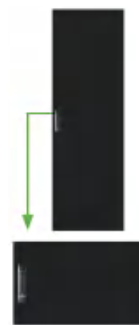
A=Steel Casement Door