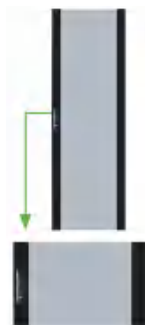
B=Smokey-Grey Glass Door